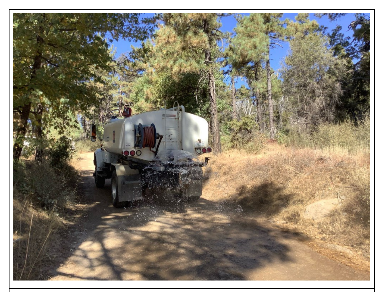
Photo 1: A water tender was observed applying water on Morris Ranch Road (C 440) to minimize dust emissions from Project vehicular traffic in accordance with APM AIR-02.