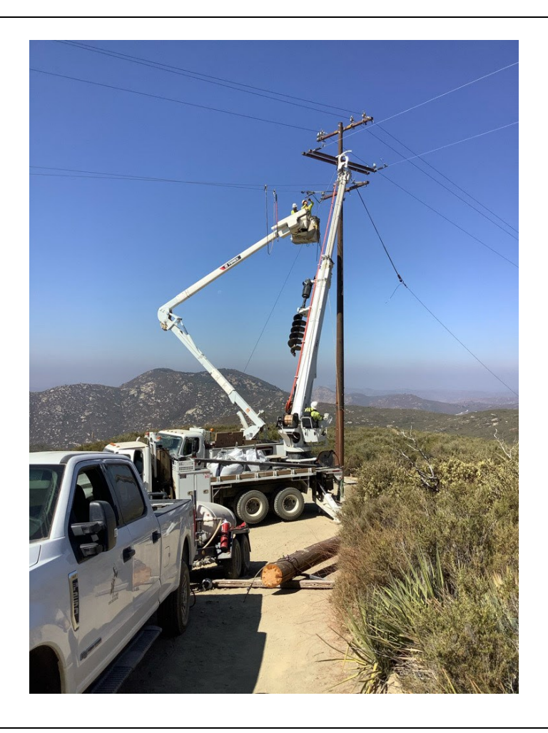
Photo 4: During overhead line work associated with wire stringing at Pole P258564 (C 79B), a Designated Fire Patrol was present and equipped with at least 150 gallons of water with pump and hose in accordance with the CFPPP Fire Prevention Matrix for conductor work with deenergized lines on USFS land with a PAL D.