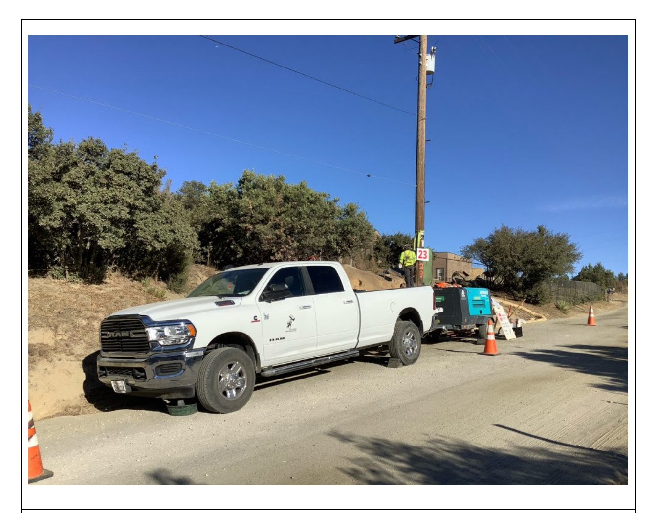
Photo 5: A drip pan was observed under a staged project vehicle at Pole P258472 (C 79B) to prevent leaks or spills from being discharged onto the ground in accordance with MM PHS-2.