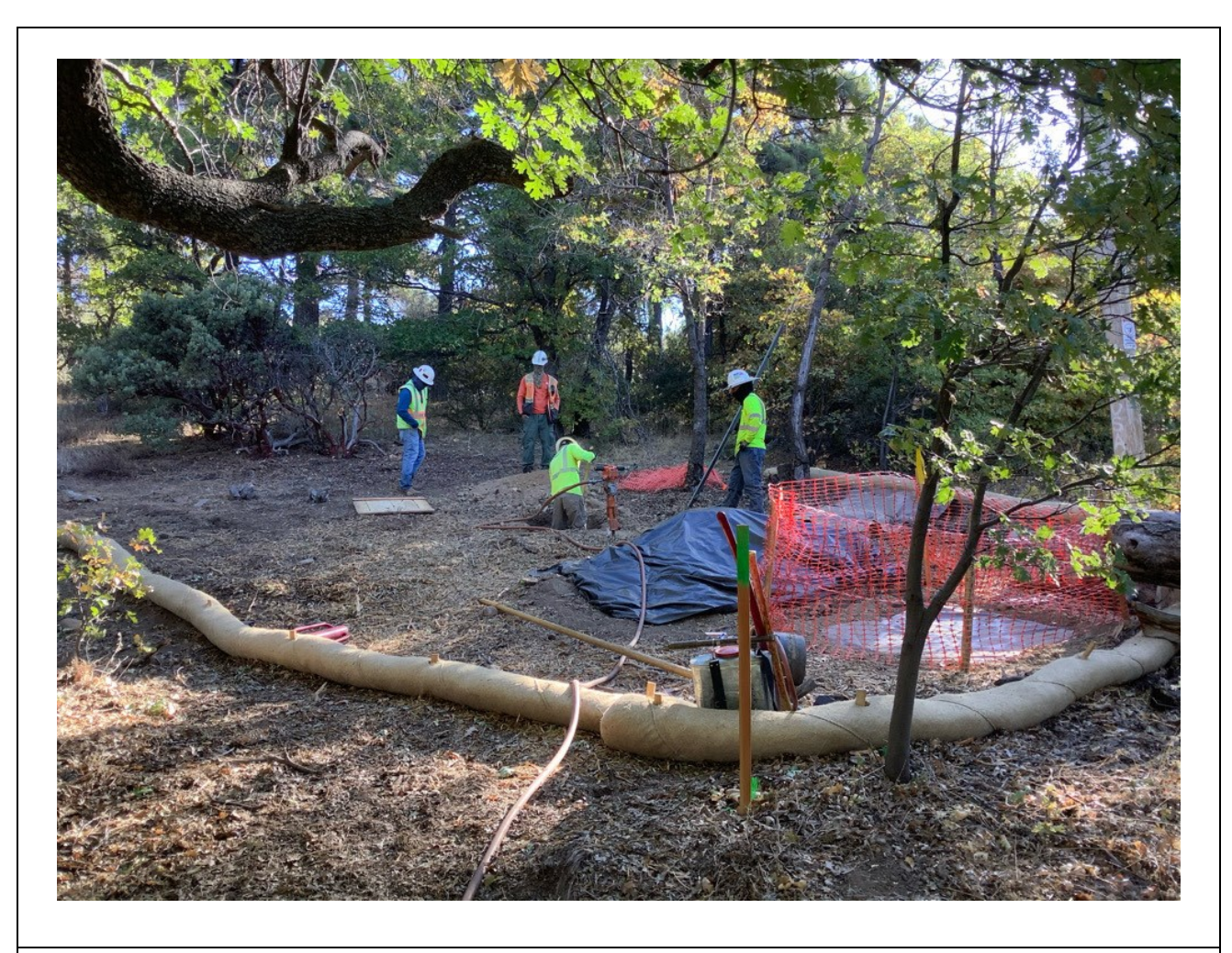
Photo 6: During anchor excavation at Pole P40392 (C 440), site-specific erosion control BMPs were observed in good condition in accordance with the ECP and SWPPP (MM HYD-1) and APM HYD-09.