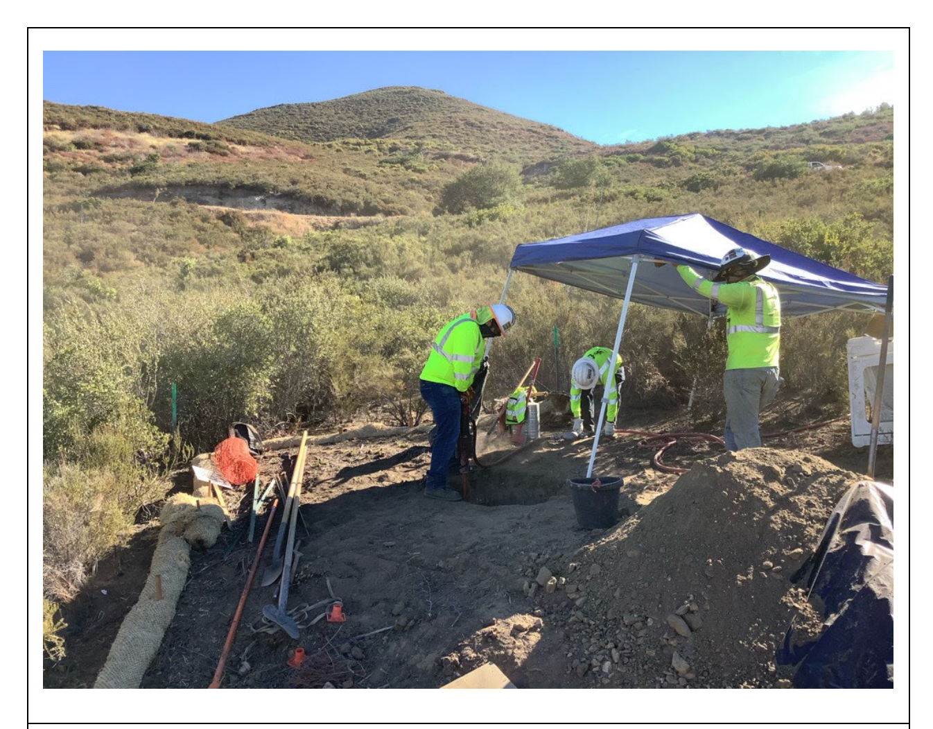
Photo 2: A crew was observed digging a direct bury pole hole at Pole P258496 (C 79B) within clearly delineated work limits in accordance with MM BIO-1.